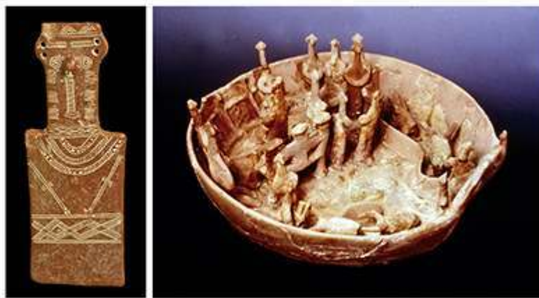
Fig. 2: Plank figurine from Bellapais Vounous – Fig. 3: Clay model from Bellapais Vounous

My current research focuses on the study of human representations from Cyprus that date primarily to Early Cypriot III-Middle Cypriot I (approx. 2000-1850 B.C.) period. These representations took the form of free-standing plank figurines (Fig. 2), figures modelled on the rim of vessels, scenic compositions on the rim of vessels (occasionally inside the bowl) (Fig. 3) and models.